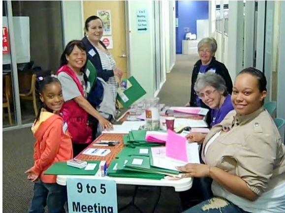
9to5 activists host RLC reception table