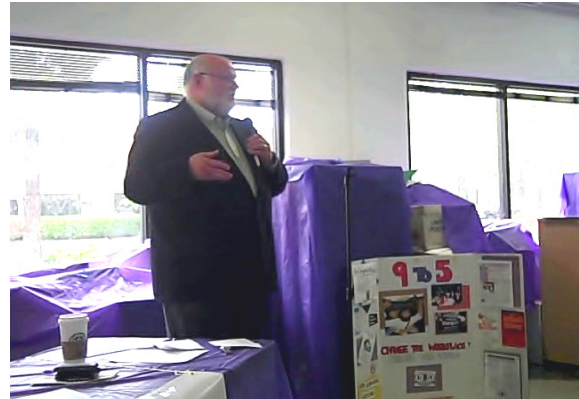
CA State Assembly Member Jim Beall